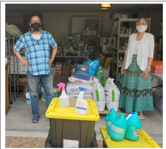
Victoria preparing for a delivery!