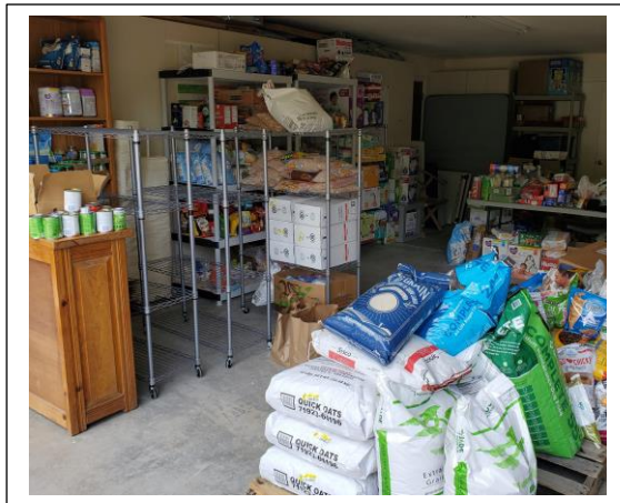
Food, Water, and Supplies